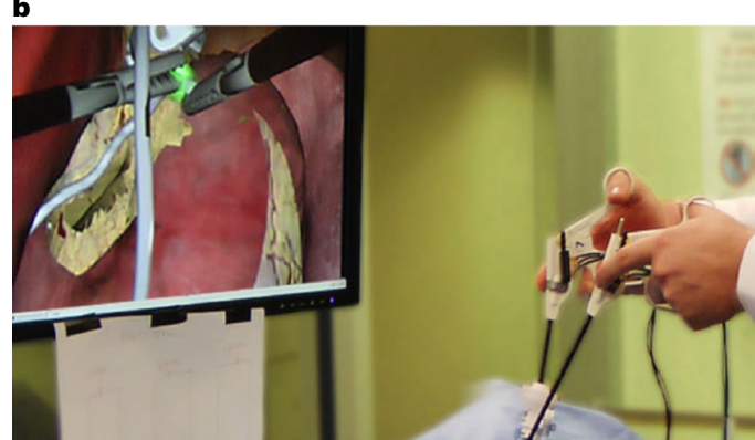
reproduced with permission from ref. ^{14} , IOS Press. Panel \bf b courtesy of Dr Suvranu De with FAMU-FSU College of Engineering.

tested and improved before fabrication in the physical world<sup>17</sup>. These technologies offer the ability to interrogate, compare and improve complex systems efficiently and effectively to consider a broader spectrum of alterations, unhindered by the requirement to build and test each option before making a design choice.