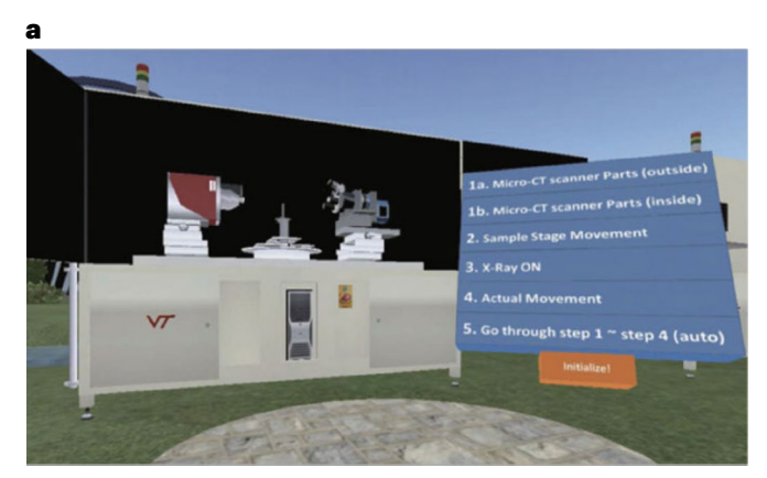
Fig. 2 | Two precursors to the metaverse. a , The Second Life Aided Training and Education (SLATE) system at Virginia Tech. b , The Laparoscopic Adjustable Gastric Banding Simulator at Rensselaer Polytechnic Institute. Panel a